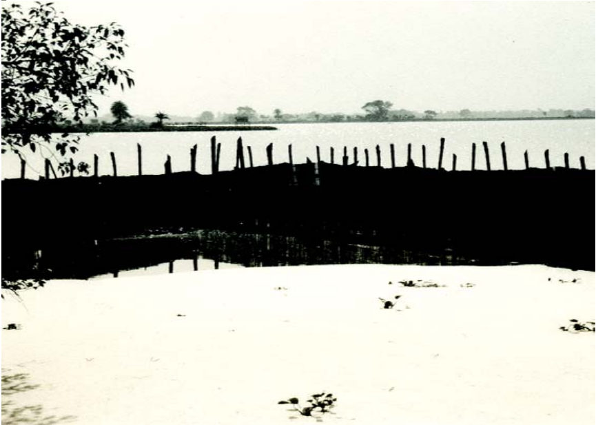
Photo: Fish Pond

In spite of such doubts, the CEMSAP report (1995: 5.2) declared garbage farming and sewage fisheries to be ‘an example of best practice in the “wise use” of wetlands’. While mildly challenging this notion, in 1997, the CEMSAP still concluded that the current practices should be continued.