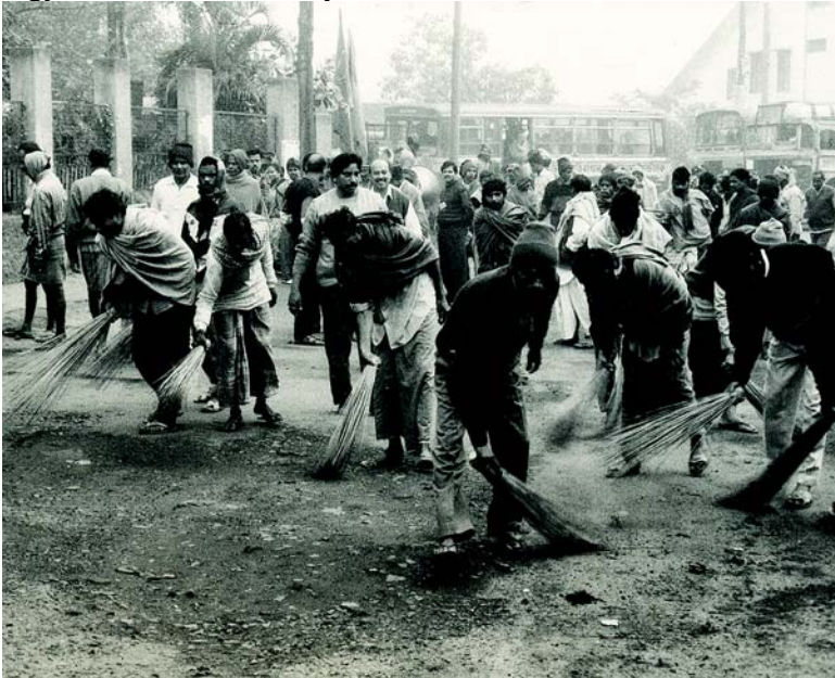
Photo: A GNS rally tidying up Howrah Maidan Crossing in early 1998