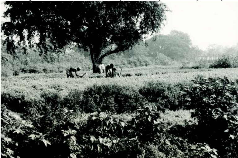
Photo: Garbage farming in the Waste Recycling Region