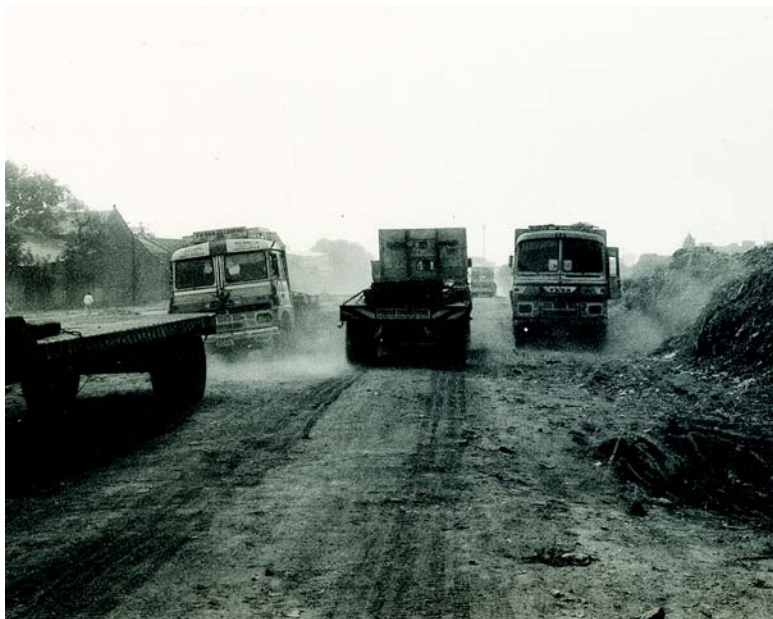
Photo: Duke Road has become Dust Road