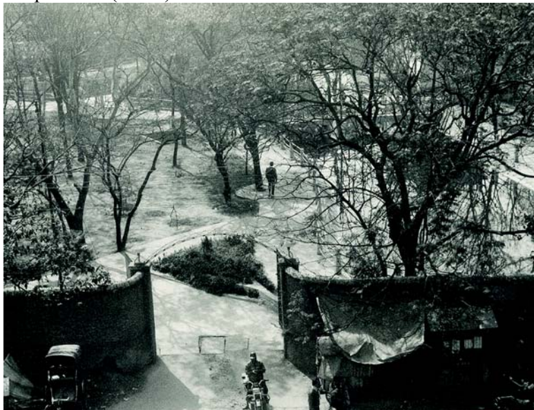
Photo: Reopened park on the former location of the civil defence camp

By late 1997, the construction of the auditorium was finished. The area immediately behind the auditorium had, however, not been turned into a children's park nor had the area around the auditorium been opened to the public. The shop stalls behind the auditorium were still unfinished in January 1998. Apparently, the Howrah Municipal Corporation (HMC) had not decided what to do here.