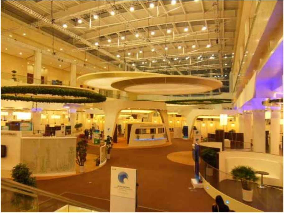
UNFCCC Climate Change Conference - Meijiang International Centre in Tianjin, October 2010

a somewhat painful experience for most participants, including China and Chinese NGOs, the UN conferences in 2010 were more rewarding.