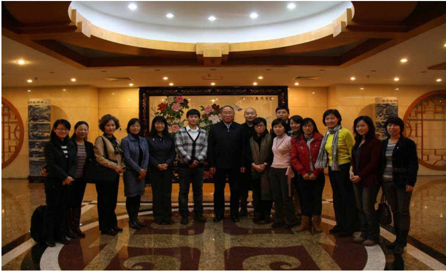
Meeting between Chinese environmental NGOs and NDRC Minister Xie Zhenhua, November 2010