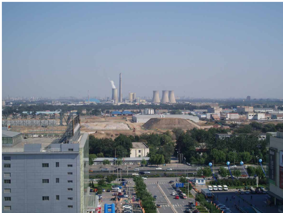
View on power station in Beijing's Chaoyang District

society is an important stakeholder in the implementation of LCAPs and Chinese NGOs could definitely play a role and provide value input and support. NGOs have already initiated many sound projects and developed innovative ideas on how to create low carbon communities and promote low-carbon lifestyles. Amongst international experts discussing LCAPs, many are of the opinion that the development of LCAPs should not simply be left to technical experts alone, but will require innovative and creative thinking from within society. Low-carbon development strategies are not just technology plans. There is need for public participation in the development of and, more importantly, in the execution of these action plans.