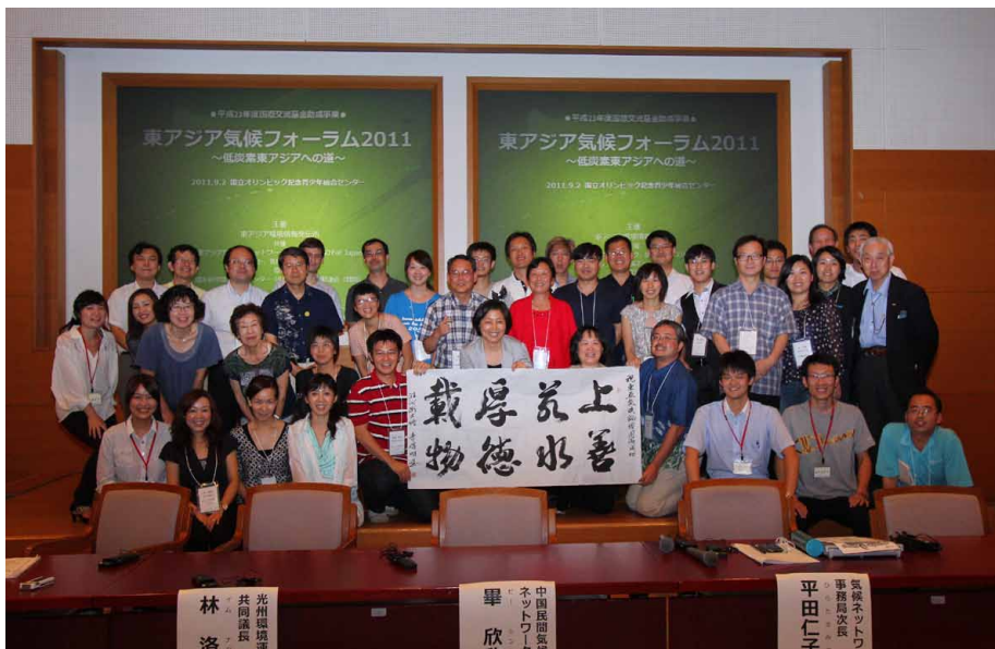
Low Carbon East-Asia conference on nuclear safety, energy security and renewables, Tokyo, September 2011.

China's rapid development of renewable energies was of particular interest for the Japanese and Korean NGO colleagues and public. In 2012, Chinese NGOs will host the next Low-carbon East Asia Forum meeting in China.