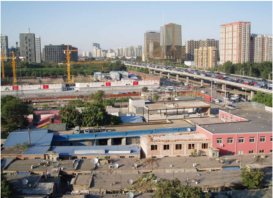
Beijing East Fourth Ring Road

US NGOs – such as the Environmental Defense Fund, Natural Resources Defense Council and The Nature Conservancy – are also beginning to contribute their resources and expertise to support the Chinese NGO climate change network and improve collaboration for a common goal. Whilst European environmental NGOs are currently not present in Beijing through representative offices, which makes closer cooperation more challenging, a number of European foundations support NGO development and dialogue with Europe. Cooperation with international NGOs in China on issues like media work,