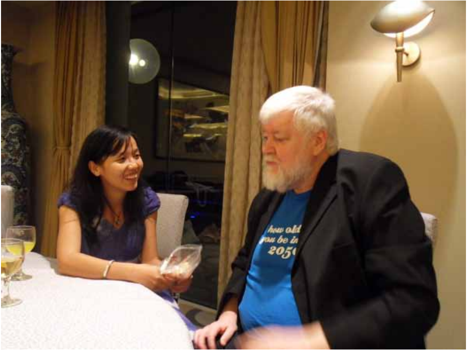
Chinese-Brazilian NGO climate change dialogue in Tianjin, October 2010