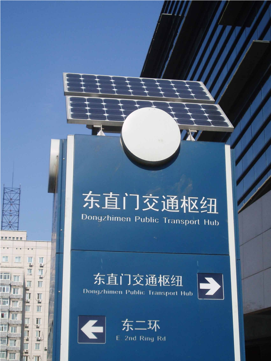
Solar PV application at Beijing's Dongzhimen Station