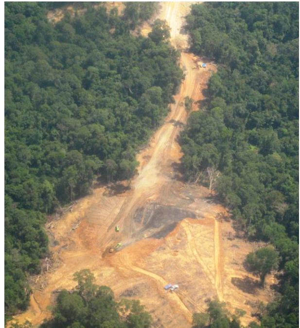
Open cut mining in Indonesian forests.

PT NNT is one of the world's giant mineral companies headquartered in Denver, Colorado, USA. The company is engaged primarily in gold and copper mining. Besides Indonesia, Newmont has regional operations in the USA, Australia, Peru, Ghana, New Zealand, and Mexico. Annually, the company produces approximately 300,000 tonnes of copper concentrate in Indonesia.