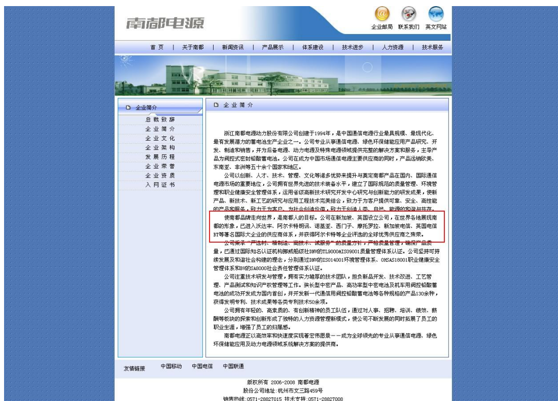
Figure 3: Narada Power Source Company Limited's website, "about us" 28