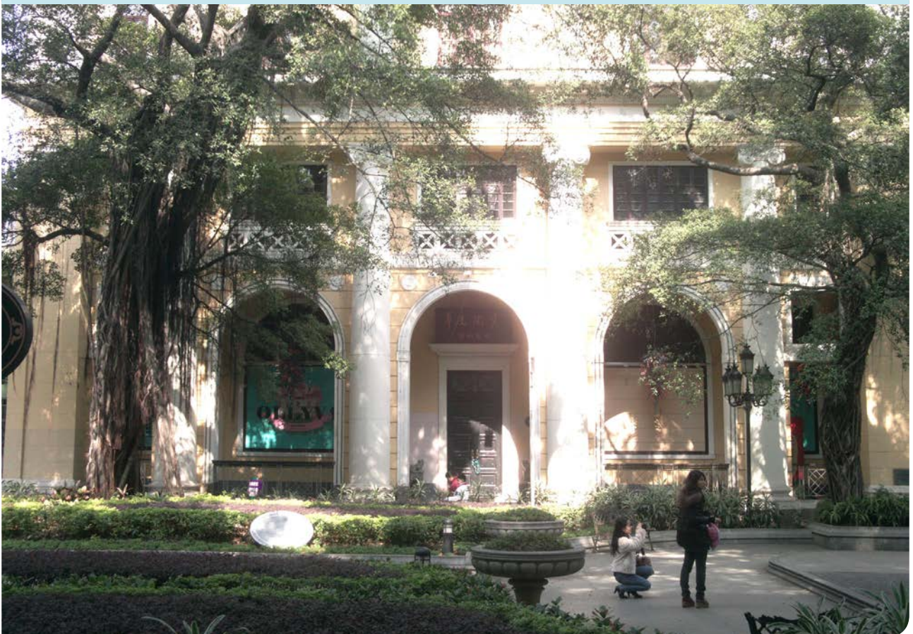
The former bank building of City Bank on Shamina Island in Guangzhou

The governance model therefore fits with the desire of the Chinese political leaders to retain its control over money and investments, without requiring much public participation. According to Green Watershed it is therefore increasingly important that NGOs exist in China to monitor banks on their social and environmental policies.