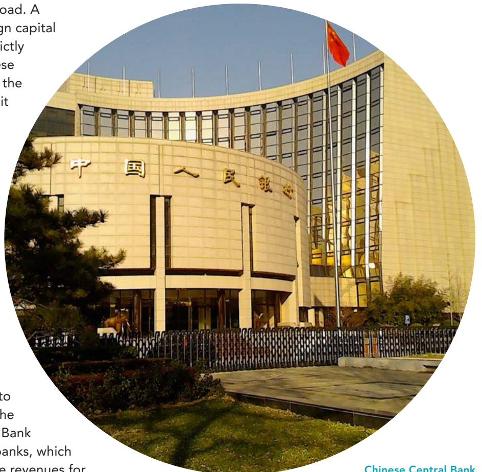
Chinese Central Bank

The Chinese empire required an injection of capital to build its own infrastructure and a national industry, and to be able to compete with the colonial powers. There were also war debts, imposed by the same colonial powers after the Opium Wars and the failed Boxer Rebellion. As a result, China had to borrow from Western banks, and pay interest on its loans. You can still see the old buildings where these foreign banks settled in the city of Guangzhou. It was probably this unequal colonial treatment that led Mao Zedong to declare in his publication The Chinese Revolution and the Chinese Communist Party (1939) that China's financial sector was monopolised by the colonial powers with their banks and loans. During the Mao-era China hardly borrowed from foreign banks or powers, and largely closed itself off from the international capital markets. After the death of Mao, successor Deng Xiaoping created