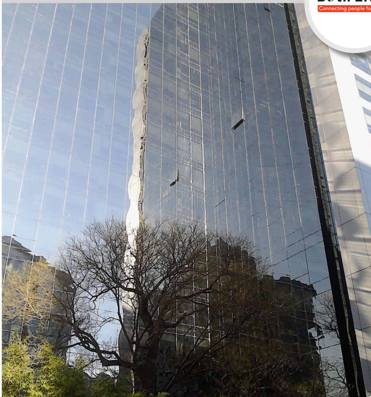
Bank building Beijing