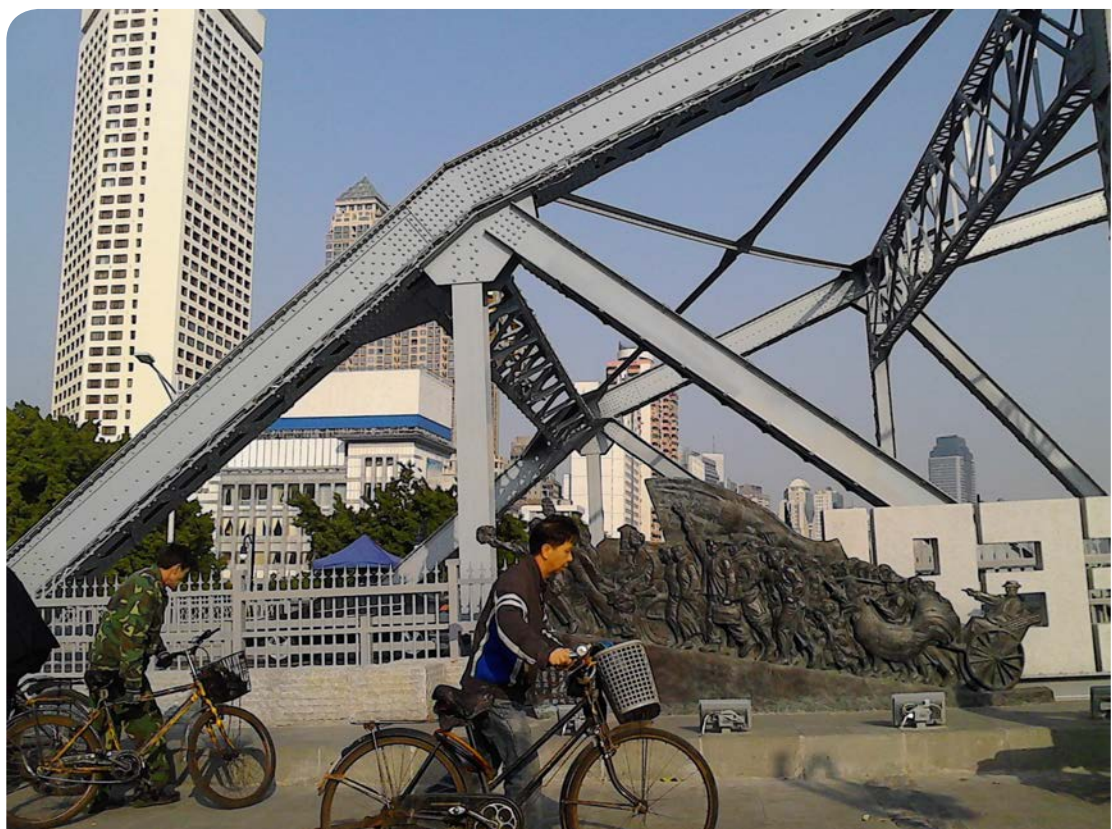
Bridge in the Guangzhou city centre

Commercial banks are only accountable to their shareholders, while public banks have to be more open, because they manage public money. In China, however, it is not possible to monitor the public banks, which makes it all the more challenging for Both ENDS and our partner organisations to do our work, because the Exim Bank and the China Development Bank are the very banks that invest the most in developing countries. How these banks conduct themselves is therefore very relevant to our partners in these countries. In many countries outside China, civil society organisations can remind public multilateral banks, such as the World Bank, that they should heed their own rules. Moreover, they can approach their governments, who not only have a share in these multilateral banks, but also have a say in the management of the banks about how money is spent. The monitoring function in such cases is performed by countries' parliaments. In China, the reality is quite different for CSOs; it is therefore important to examine how they can still exert influence within the Chinese political context.